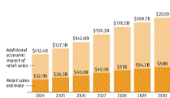
CHART 1.0E: U.S. Cannabis Industry Total Economic Impact: 2024-30

NOTE: Estimates are on a high-end of risks. © 2024 MJBiz, a division of Iversen LLC.